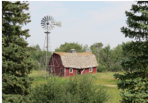
Barn, 2014 Photo Contest

Note: A voucher may vouch for more than one person if all such persons share the same place of residence.