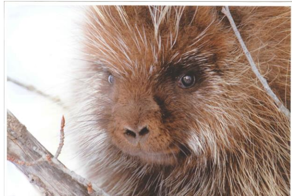
Porcupine, 2014 Photo Contest