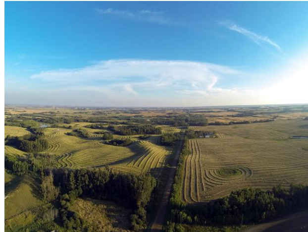
Looking South, 2013 Photo Contest

The Reeve sits for one year and may be reappointed.