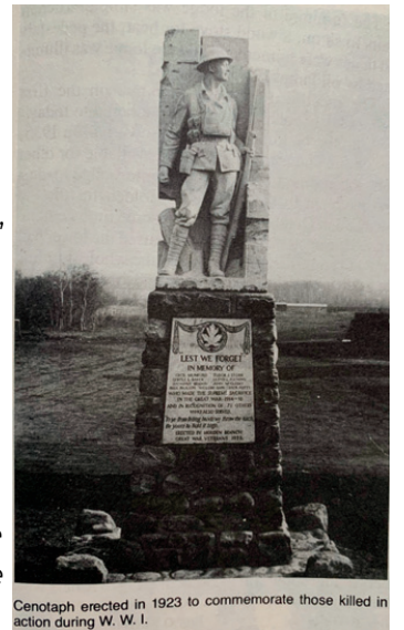
Cenotaph erected in 1923 to commemorate those killed in action during W. W. I.

Sources: Holden History Book and Remembered in Bronze and Stone - Canada's Great War Memorial Statuary